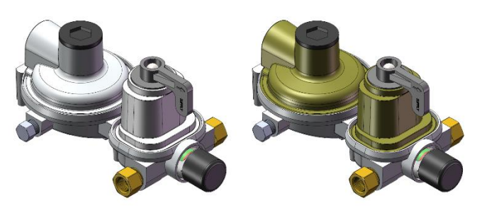
FIGURE 1: MEGR-253 AND MEGR-253H

Prior to removing the empty cylinder, position the black changeover lever so that it points to the alternate cylinder that is now supplying the regulator. Close the valve on the empty cylinder and remove. After the empty cylinder is refilled and